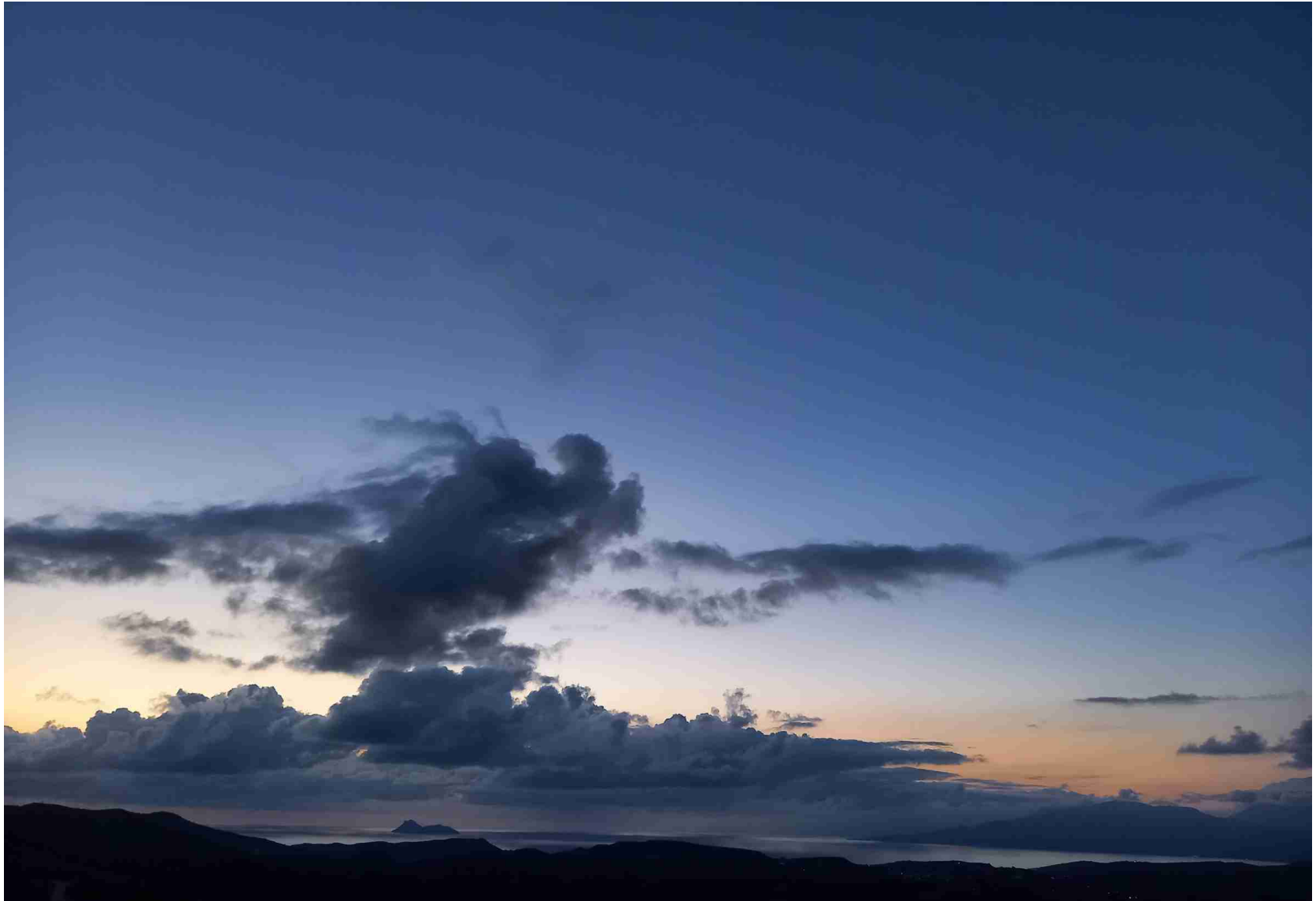
Listaros village, Crete